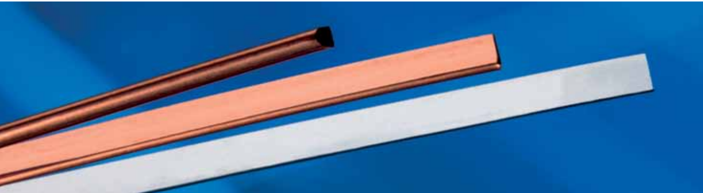
Sunwire is rolled from round wire and hot-dip tinned. This unique technology brings strength from softness.