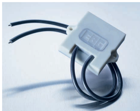
Figure 1: UXP2000 (left) and ULX2000 resistor type for inverter applications